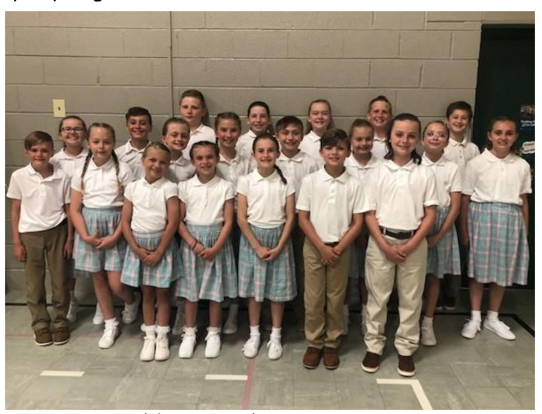
3rd & 4th Grade Maypole Dancers