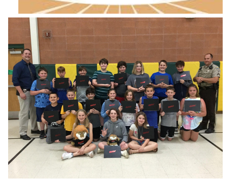
5th Grade D.A.R.E. Graduation was held on Wednesday, May 11th.

Breakfast 2.20 Lunch 3.00 Extra Milk .50